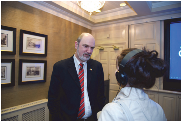
Interview with the Irish State Radio

"Recently, I was lecturing in Nepal where for several years, they had a communist dictatorship in what is a very religious country. Now, many Hindus want to take revenge for the communist era by putting atheists in prison. If this country wants to have a future, it will not help if everybody struggles for power. My experience is that the global charter of conscience opens the space for debate between people who have not talked to each other for a long time. When religious people and non-religious people come together and talk to each other we can discover how to maintain both sides in a society. It is not about who should leave but how we can co-exist. Let's find common solutions."