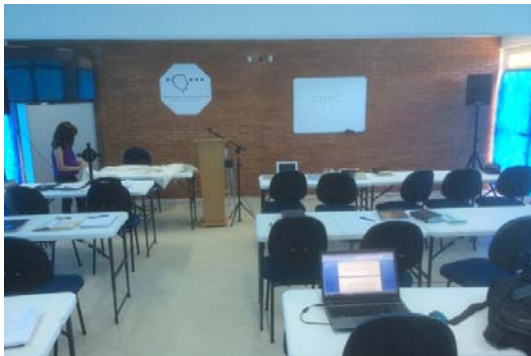
Lecture room, MBS Brazil

de Janeiro. The nickname “Mackenzista” is often used to refer to current or former Mackenzie students, as many of its alumni regularly enter state service.