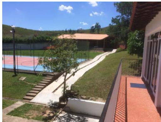
MBS Brazil – view from the lecture hall

The training center of Martin Bucer Seminary lies outside of São José dos Campos – SP, at Estrada Varadouro which is provided by a successful constructor. The students live and study at the training center for one week every semester. In addition to the two yearly intensive study weeks at the training center they meet monthly for study and discussion in six further Brazilian cities: Araguara (SP), Brasília (DF), Rio de Janeiro (RJ), São José dos Campos (SP), Três Lagoas (MS) and Volta Redonda (RJ).