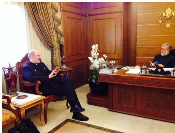
Audience with Catholicos Aram I.