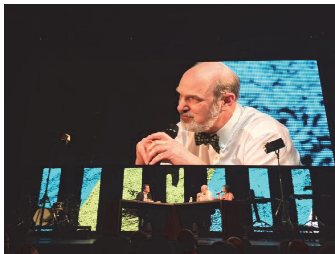
During the discussion