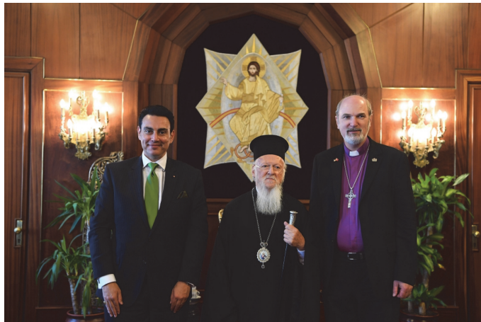
Prince Gharios and Thomas Schirmmacher with the Ecumenical Patriarch in Istanbul

The claims of the Ghassanid Royal House and its present head were examined and recognized by the highest courts in Brazil and California and checked by the Vatican with a favorable opinion. Additionally, the Royal house received “special consultative”