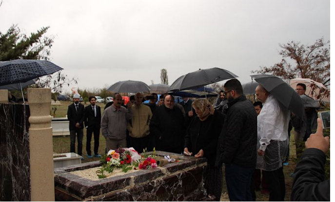
provinces, there are still no At the Armenian Cemetery in Malatya

According to statistics from Silas Ministries, in the last ten years the number of Protestant Christians in Turkey has roughly doubled, from about 3,000 in 2007 to about 6,000 today. In that time, the number of Protestant churches has risen from about 100 to about 150 today. However, in more than 30 of the 81