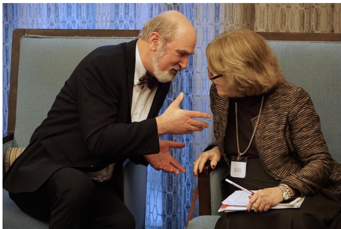
Thomas Schirmmacher talks with the Ukrainian Minister for Education and Science, Dr Liliia Hrynevych

Publicizing the work of human rights defenders is sometimes an effective way to enhance their protection. However, lawyers seeking to protect the human rights of accused persons often face the risk of persecution by those (including government representatives) who prefer to keep such criminal cases quiet and out of public view. It is important for human rights organizations to sensitively balance the value of disseminating information publicly and the possibility that by doing so, they may risk exposing lawyers or other human rights defenders to physical harm.