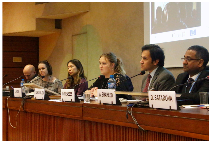
The panelists

Following the introductory package of videos, there is a second series of short videos, on “Access to Justice.” Till now there are only four and these are only in English. More educational videos are promised.