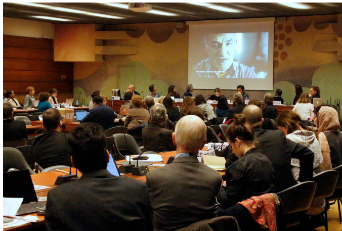
During the screening of the film “My Enemy, My Brother”