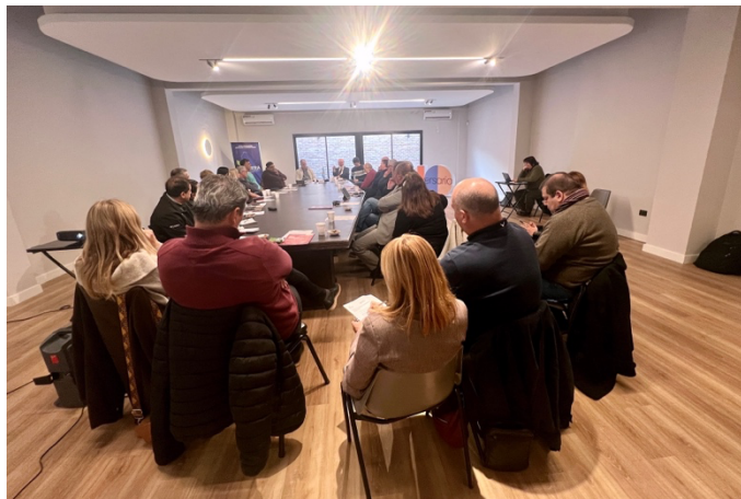
During the meeting