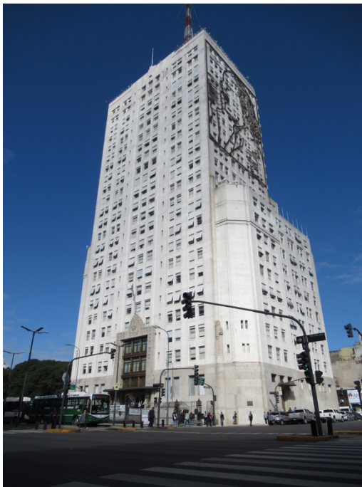
Ministry of Public Works Building with the “El monumento a la coima”

As for the sculpture, although the official version does not confirm it (since it does not appear in the project of the building, nor in the plans, nor in any file), several historians and architects believe that its creation was a spontaneous denunciation of the bribes that abounded in the concessions of public works in Argentina in the 1930s. Nowadays taken for granted that the sculpture was made by the artist Troiano Troiani.