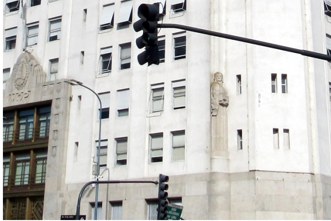
Ministry of Public Works Building with the "El monumento a la coima"

An icon of Buenos Aires, the first skyscraper in the city, 93 meters high and 22 stories high, the Ministry of Public Works was the place, where in 1951 the first television broadcast in Argentina took place as well as Eva Duarte de Perón's "Renunciation Speech" in the same year. Today, the building is mainly known for the image of Eva Perón, which was installed in 2010 at the initiative of Peronist President Cristina Fernández de Kirchner.