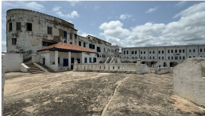
Cape Coast Castle in Ghana