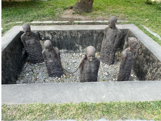
Slave trade memorial in Zanzibar

The Anglican cathedral Christ Church was built in Stone Town on the site of the largest slave market in East Africa. Its altar was erected on the exact spot where the slaves for sale were whipped. Outside the cathedral is a stone monument depicting four people tied by the neck.